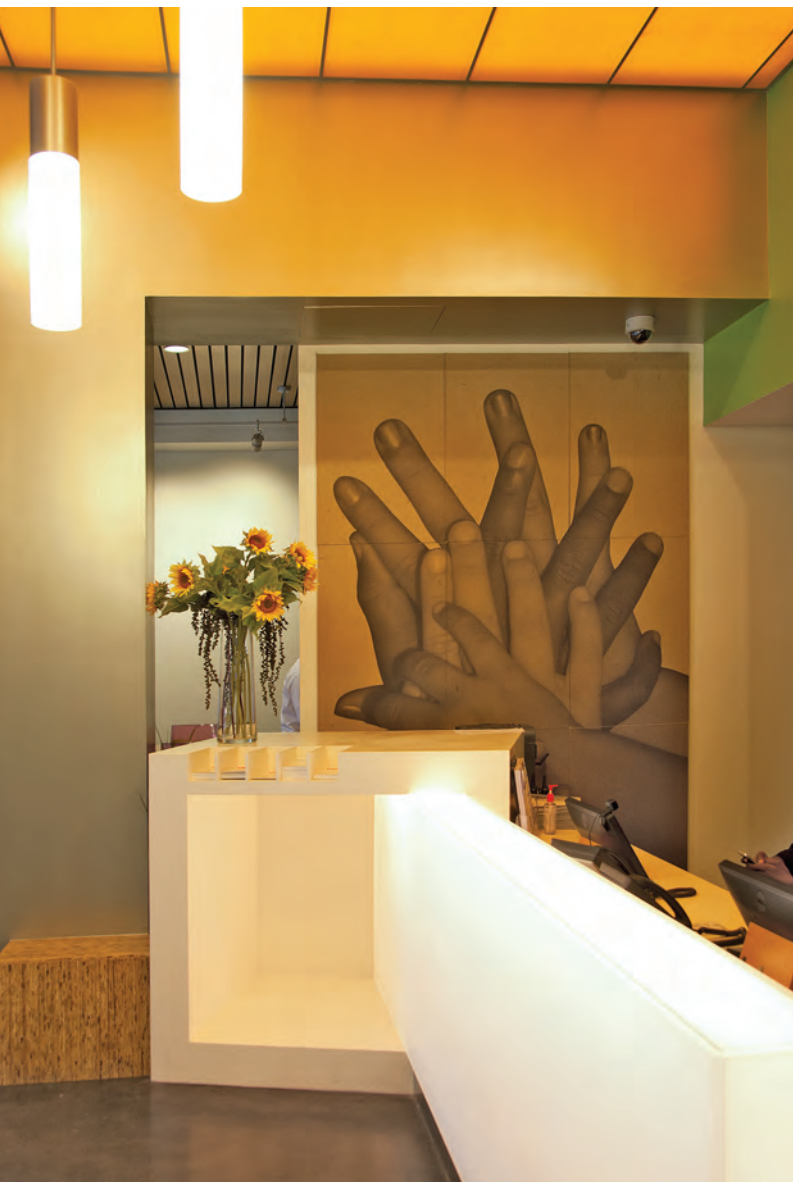
ABOVE Storytelling elements and large-scale environmental graphics created by local artists help convey both the rich history and community mission of YMCA Anthony Bowen.