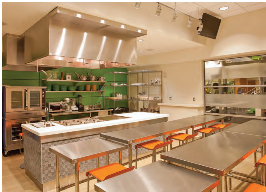
RIGHT TOP TO BOTTOM Sophisticated design details abound within the facility, including the slat wall and ceiling framing the entrance to the locker area; the textured, undulating wall tiles surrounding the six-lane pool; and the stainless steel demonstration kitchen.