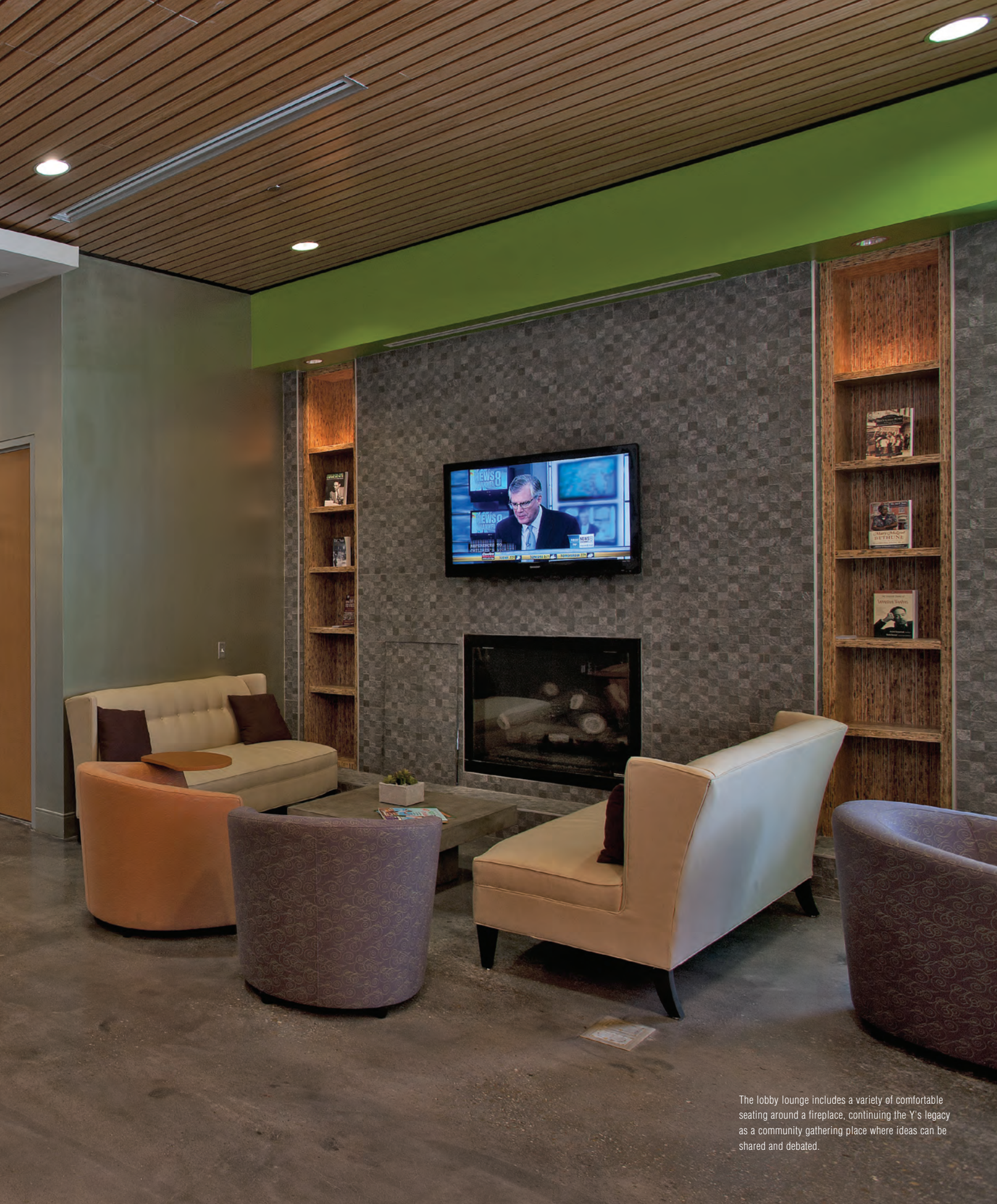
The lobby lounge includes a variety of comfortable seating around a fireplace, continuing the Y's legacy as a community gathering place where ideas can be shared and debated.