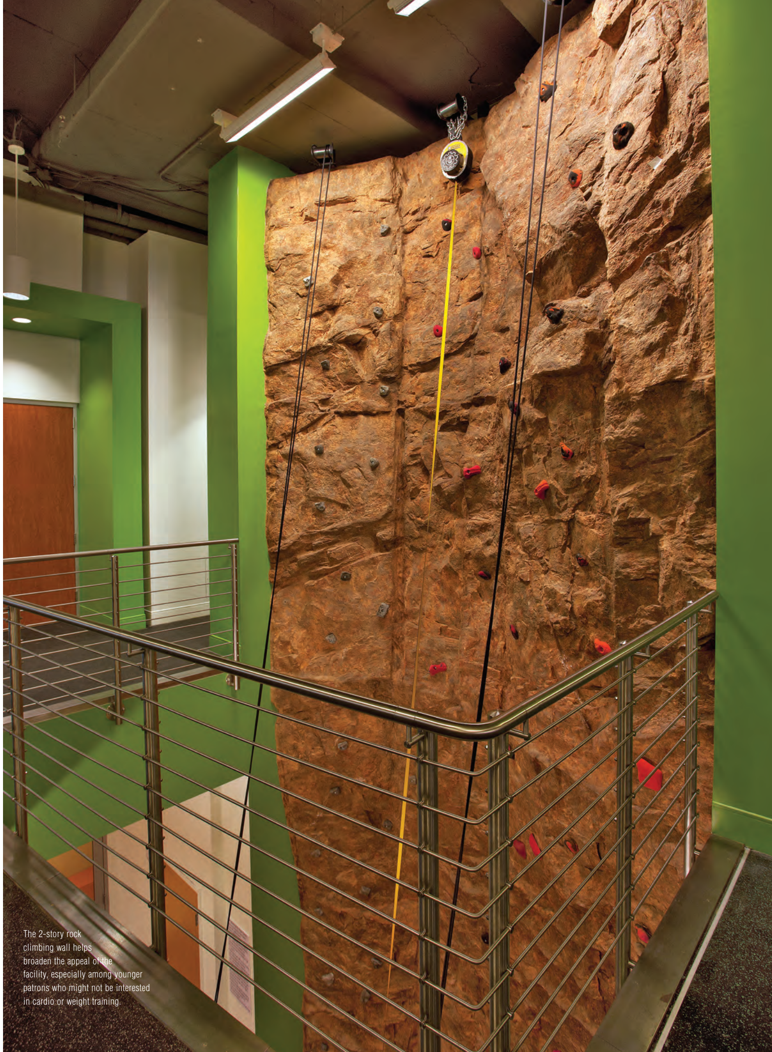
The 2-story rock climbing wall helps broaden the appeal of the facility, especially among younger patrons who might not be interested in cardio or weight training.